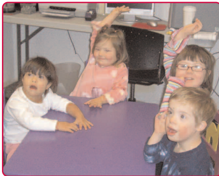
"Who wants to Read? I DO!"

Call the Playhouse to receive a registration form. Once that is submitted, your child will be placed on the list for the upcoming 16 week session. You must re-enroll for each 16 week session.